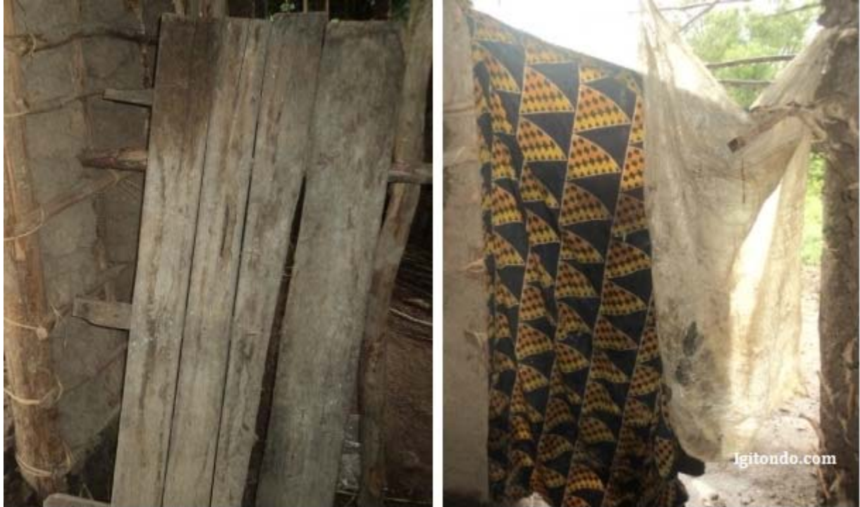
Bakingisha imbabari, ibitenge cyangwa imifuka

Aba baturage kandi baba mu mazu atagira inzugi n'amadirishya kuko « ubuyobozi bw'umurenge bwababwiye ko buzabaha inzugi n'amadirishya ari uko barangije guhoma ».