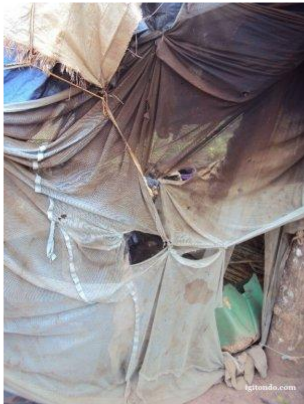
Muri iyi nzu imbere, niho hakorerwa imirimo yose, irimo no guteka.